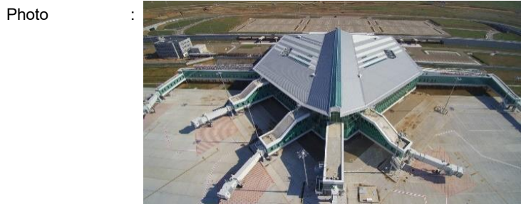
<Passenger Terminal Building>

Passenger : 1.42 mil (1.02 mil.(international) /0.40 mil.(domestic), 2018 in current airport)