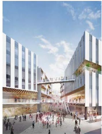
Transport Plaza (Conceptual Drawing)