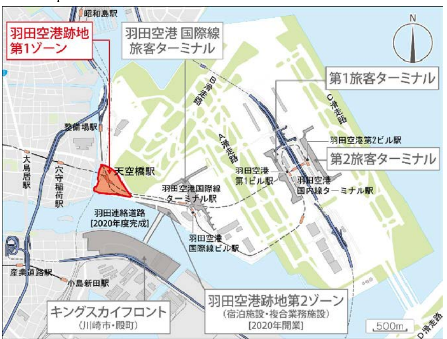
Subject Area Map (1)