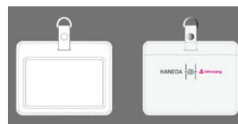
Original PASMO card case Limited to first 1,000 customers