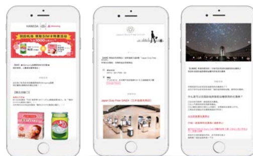
Conceptual image of Haneda Airport page

* Contents will be progressively expanded