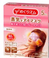
Kao Megurism Steam Eye Mask 5-pack Limited to first 1,000 customers

The campaign will end when all prizes have been given away.